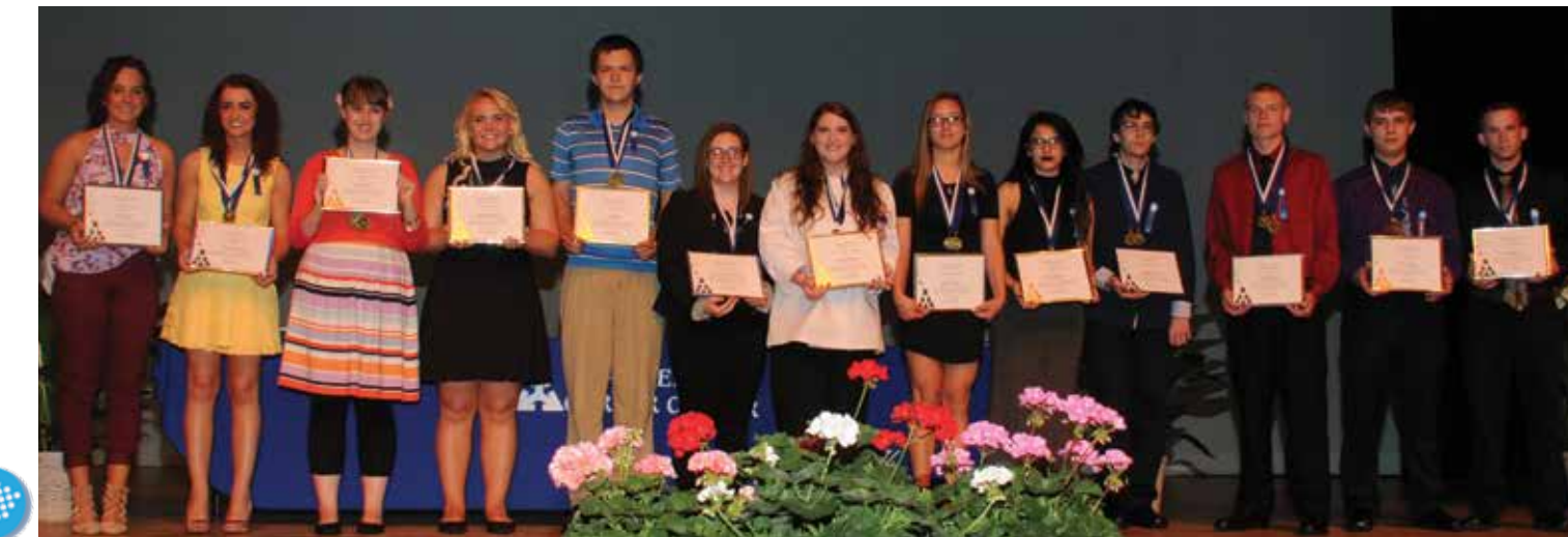
Principal Award Recipients for 2017.

Tri-Rivers recognized and celebrated the hard work of our Seniors to accomplish their many diverse goals at the 2017 Senior Recognition held at the historic Palace Theatre in downtown Marion